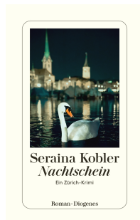
Bright Night 288 pages 2023 🏆 Award winner 📈 Bestseller