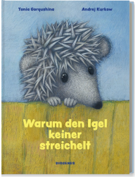
Why Nobody Strokes Hedgehogs 36 pages, 20.5 x 28 cm 2021