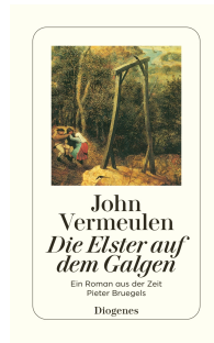
Magpie on the Gallows 496 pages 1995