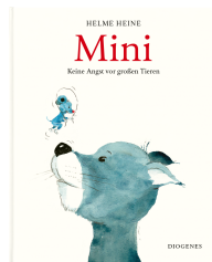
Mini 36 pages, 22 x 27.5 x 0.9 cm 2023