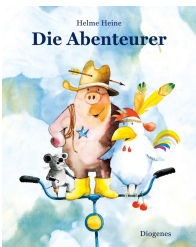
The Adventurers 28 pages, 22 x 27.5 cm 1994