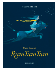
My Friend RamTamTam 36 pages, 22 x 27.5 x 0.8 cm 2021