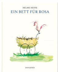
A Bed for Rosa 32 pages, 22 x 27.5 x 0.8 cm 2025