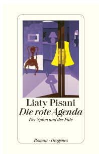
The Red Diary 416 pages 2012