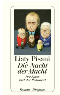
The Spy and the President 352 pages 2002