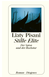
The Spy and the Rockstar 384 pages 2004