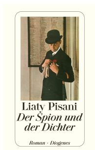
The Spy And the Poet 416 pages 1997