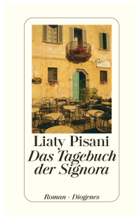
The Signora's Diary 288 pages 2007