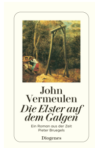
Magpie on the Gallows 496 pages 1995