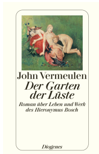
Garden of Earthly Delight 592 pages 2002