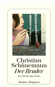
The Brother 288 pages 2008