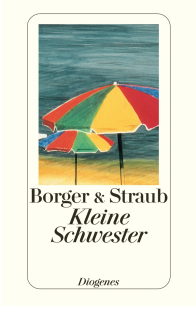
Little Sister 224 pages 2002