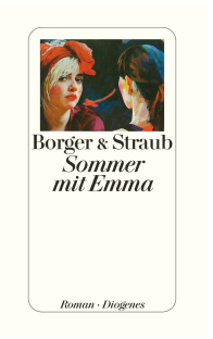
Summer with Emma 416 pages 2009