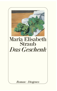
The Gift 336 pages 2006