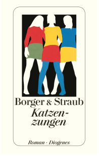
Cats' Tongues 368 pages 2001