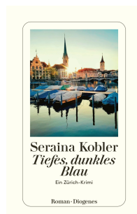
Deep Dark Blue 272 pages 2022 🏆 Award winner 📈 Bestseller