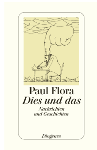
This and That 144 pages 1997