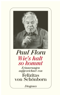
As Luck Would Have It 320 pages 2007