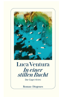
In a Hidden Cove 336 pages 2022