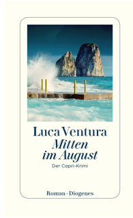
In the Middle of August 336 pages 2020