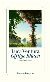
Poisonous Blossoms 368 pages 2026