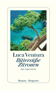
Bittersweet Lemons 320 pages 2021