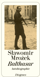
Baltazar 384 pages 2007