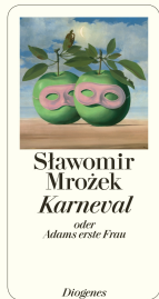
Carnival or The First Wife of Adam 80 pages 2014