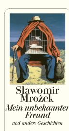
My Unknown Friend 192 pages 1999