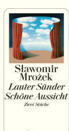
All Sinners and A Lovely View 208 pages 2002