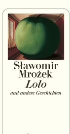
Lolo 304 pages 2000