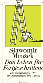
Life for the Advanced 240 pages 2006