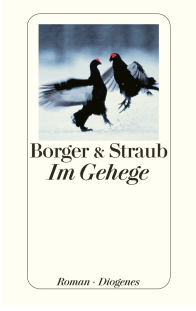
In the Ring 384 pages 2004