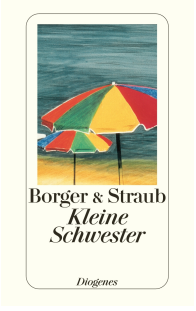
Little Sister 224 pages 2002