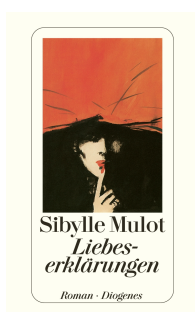
Declarations of Love 176 pages 1994