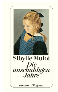
Innocent Years 240 pages 1999