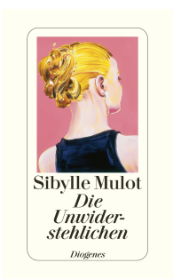
The Irresistibles 160 pages 2007