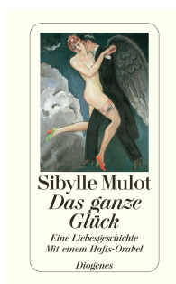
Perfect Happiness 176 pages 2001