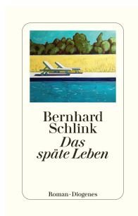
The Late Life 240 pages 2024 🏆 Bestseller