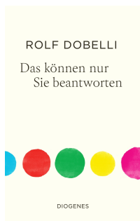
Only You Can Answer That 320 pages 2026

Rolf Dobelli, born in Lucerne in 1966, studied philosophy and business management, worked for Swissair, founded several companies and lived in Australia, Hong Kong, England and in the USA. He is the founder of World.Minds and has published eight books with Diogenes, most recently Your Turn . His novels and non-fiction, among them the global bestsellers The Art of Thinking Clearly and The Art of Acting Clearly , have been published in 50 languages. Rolf Dobelli lives with his family in Berne.