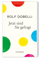
Your Turn 320 pages 2026