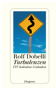
Turbulence 160 pages 2007