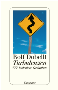
Turbulence 160 pages 2007