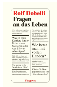
Questions to Ask of Life 208 pages 2014

Rolf Dobelli, born in Lucerne in 1966, studied philosophy and business management, worked for Swissair, founded a company and lived in Australia, Hong Kong, England and in the USA. He has published six books with Diogenes, most recently ›Massimo Marini‹, and with Carl Hanser Verlag his two non-fiction bestsellers ›The Art of Thinking Clearly‹ and ›The Art of Acting Clearly‹. Rolf Dobelli lives with his family in Berne.