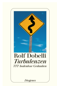
Turbulence 160 pages 2007