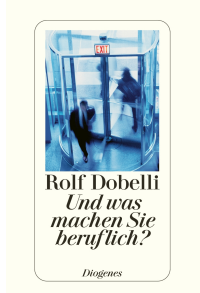
What Do You Do for a Living? 240 pages 2004