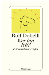
Who Am I? 144 pages 2007