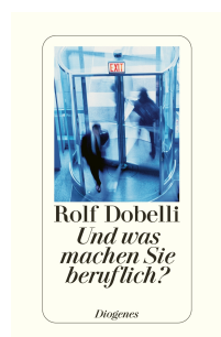
What Do You Do for a Living? 240 pages 2004