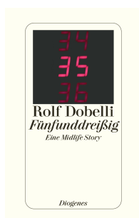
Thirty-five 208 pages 2003