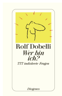
Who Am I? 144 pages 2007