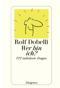
Who Am I? 144 pages 2007