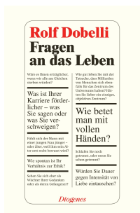
Questions to Ask of Life 208 pages 2014