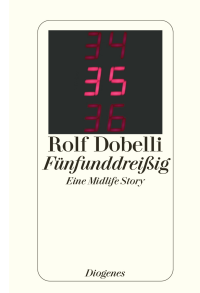
Thirty-five 208 pages 2003