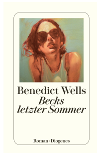
Beck's Last Summer 464 pages 2008