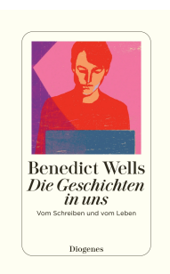
The Stories Inside Us 400 pages 2024

»If you want to convince a young person that reading is fun, you'd best offer him a book by Benedict Wells.« – NRC Handelsblad, Amsterdam