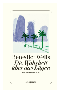
The Truth About Lying 256 pages 2018